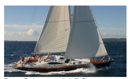
Grand Soleil 54