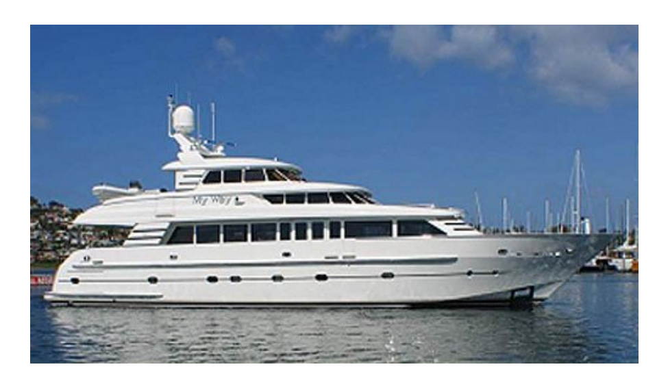
33 m LOA s/y Elektra ( priv. ) ( PL flag )