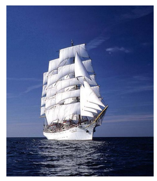
62 m LOA s/v Fryderyk Chopin (STAP) ( Pl flag )

102 m LOA s/v Dar Młodzieży (HMS) ( PI flag )