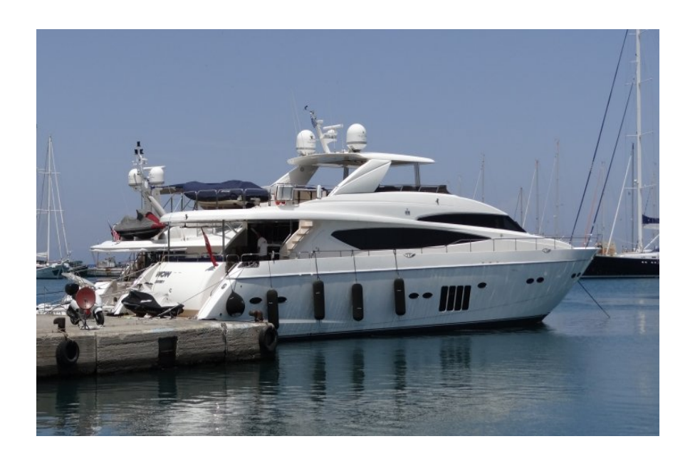
26 m LOA m/y Lia - A ( 2 \times 1350 \text{ hp} ) ( priv. ) ( GB flag )