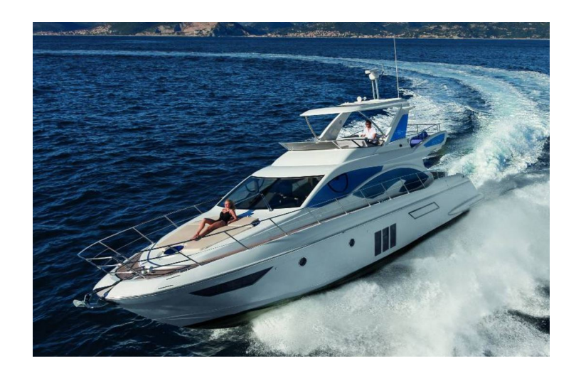
15,5 m LOA m/y Mediterranean Muse Rodman 50 (company) (SP flag)