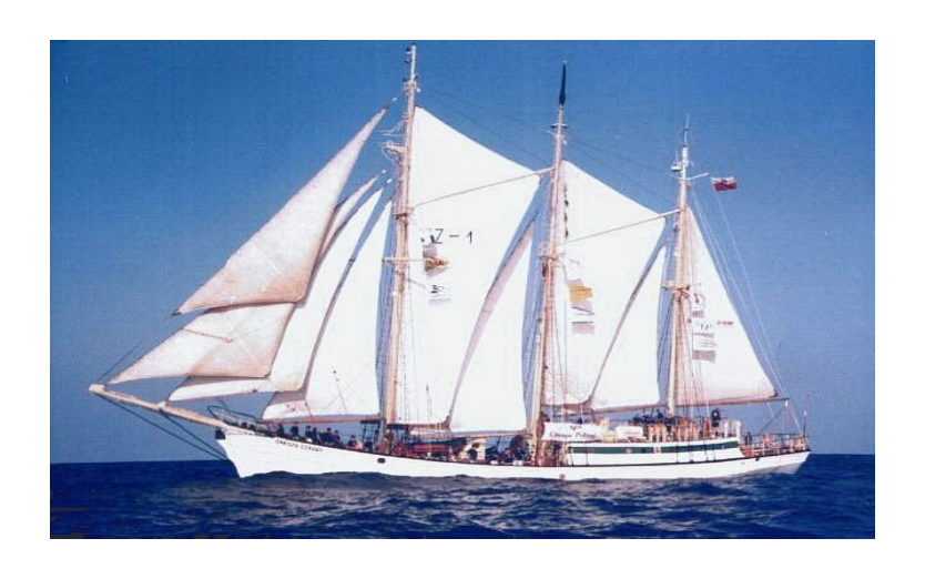
44,2 m LOA ( priv. ) (GB flag )