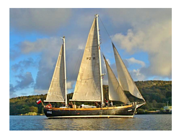
18,6 m s/y Blue Note ( priv.) ( US flag)